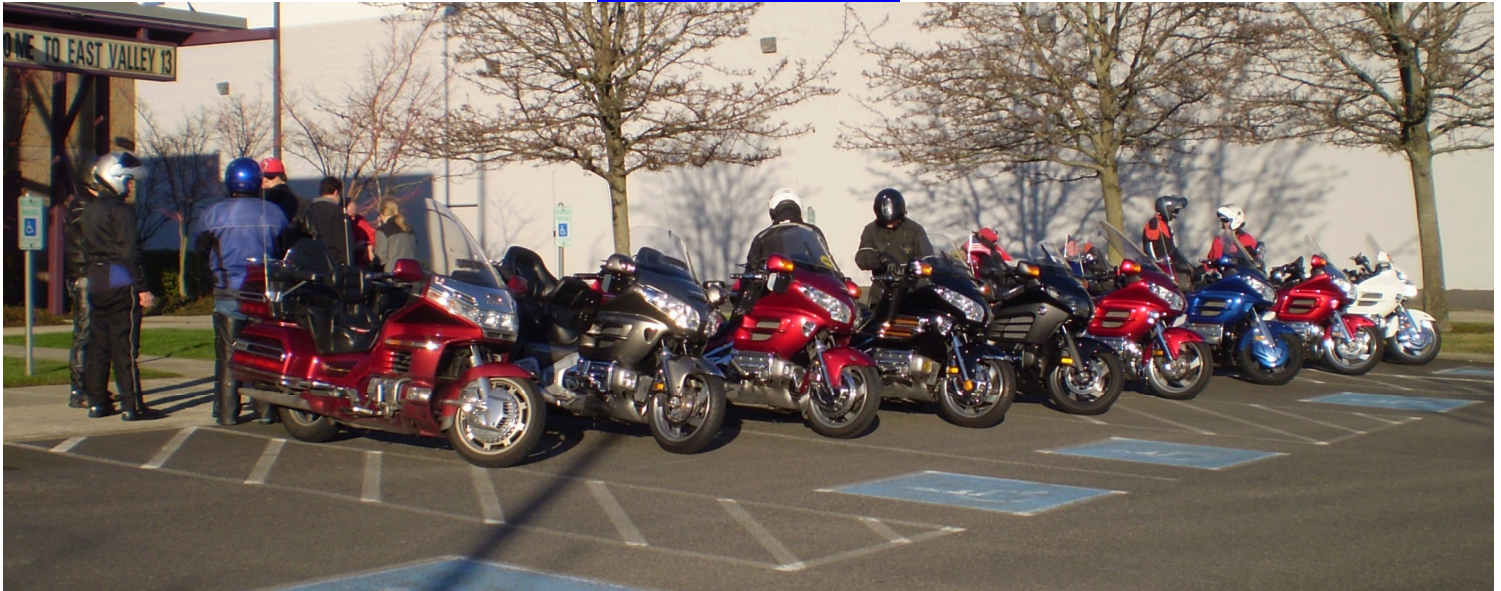
New Years Day Riders. Getting ready to go.